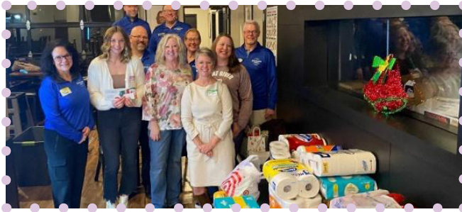
The Hutchinson Ambassadors raised money, gift cards, and essential supplies for our clients during Business After Hours at River House.