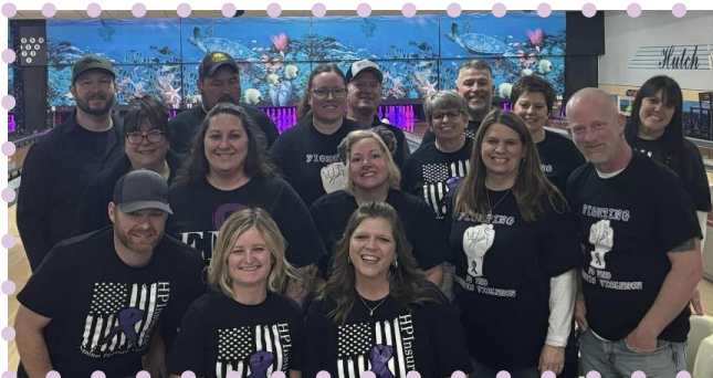
HP Insurance wins again!