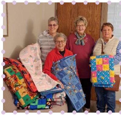
Bethlehem United Methodist Church Comfort Quilters donated handcrafted quilts for clients.