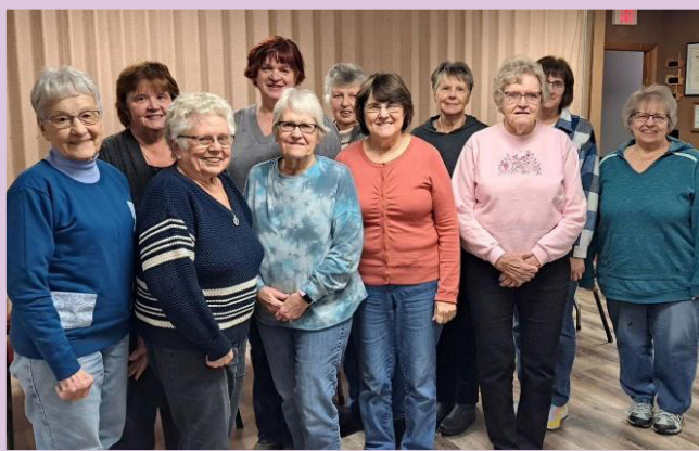
The General Federation of Women's Club (GFWC) of Silver Lake made a generous donation to the McLeod Alliance Page it Forward Book Drive Fundraiser.