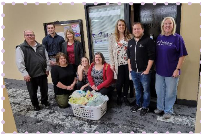
The Broll Team – Keller Williams Integrity Northwest collected items during a supply drive for Alliance clients.