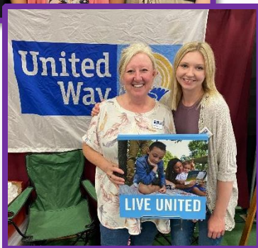
Alliance staff partners with UWMC at the 2022 McLeod County Fair.